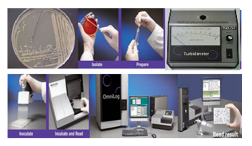
Figure 1: BiOLOG Micro Station identification steps and whole set equipment.