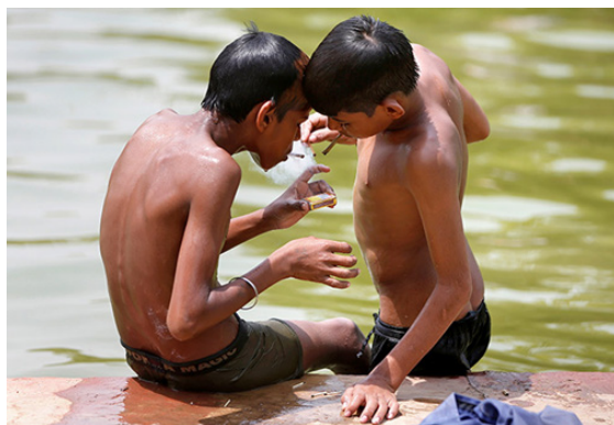
Figure 3: Copied habit young boys smoke a bidi.