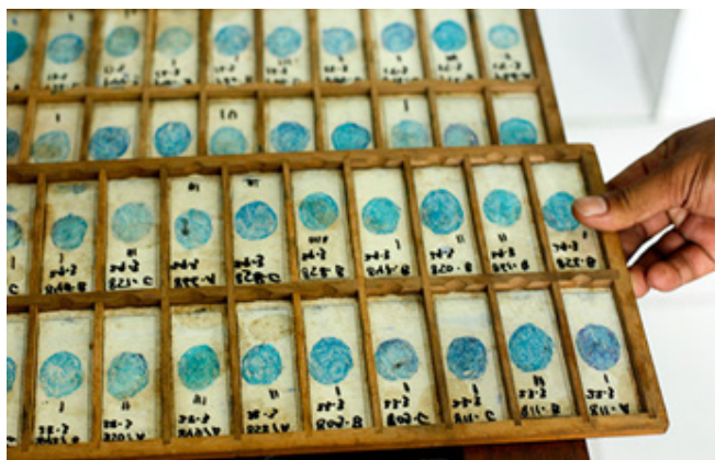
Figure 5: Sputum samples.