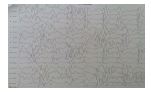
Figure 1: EEG showing typical infantile spasm waves.

Management of Aicardi syndrome is mainly symptomatic and seeks to address seizure control. Medical management consists of antiseizure medication either as monotherapy or a combination of various classes of medication [3]. Surgical management is usually reserved for refractory cases and is often palliative in nature; it takes the form of either corpus callosotomy or vagus nerve stimulator implantation [12] or a combination thereof [7]. Despite those advances, children are rarely if ever seizure free [13]. The prognosis of Aicardi syndrome is generally poor and genetic counselling is almost always required [14]