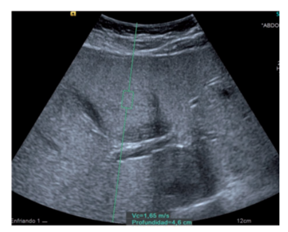
Figure 2: A 9-year-old obese boy. Ultrasonogram showing moderate increase in liver echotexture (Grade 2 hepatic steatosis) and shear wave velocity of 1.65 m/s (ARFI category 3).

NAFLD is a common liver disease worldwide and US is widely used in screening [7,24]. Moreover, US has a reasonable accuracy for detecting moderate-to-severe HS, although it is less accurate for detecting mild HS [25,26] and it cannot exclude fibrosis (6). Also, the evaluation of NAFLD by US has important interobserver variability and the reproducibility of results is limited [25,27]. However, US has a high negative predictive value for excluding NAFLD in subjects with a normal or slightly increased liver echogenicity, with an accuracy of more than 80% [24] and US examination of the liver is recommended as an initial screening procedure.