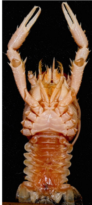
Figure 2: Munida andamanica Alcock, 1894 Ventral view.