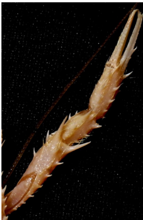
Figure 5: Munida andamanica Alcock, 1894- Right dorsal.