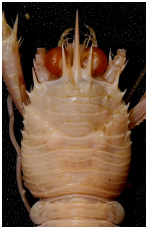
Figure 3: Munida andamanica Alcock, 1894 Carapace and anterior part of abdomen.