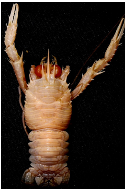
Figure 1: Munida andamanica Alcock, 1894 Dorsal view.

The description given by Alcock (1901) agrees with present specimen. The carapace of this specimen is illustrated in (Figure 3) a pair small spines are present in immediately behind the large gastric pair which are in line with the supra-orbital spines. These small spines are present in present specimens and may be quite conspicuous; based upon the geographical ground depends of proper nutrients of environment. The eyes are large and globular but the conspicuous fringe of setae mentioned by Alcock (1901). The chelipeds are less than twice the length of the carapace except in a male specimen. The chelipeds are beset with long plumose setae which may give a feathery look to the appendage, when fresh condition of by-catch specimen (Figure 5). The second, third and fourth legs agree with description given by Alcock, except long chelipeds are present.