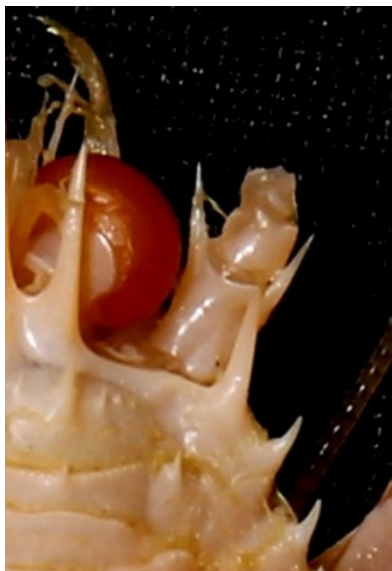
Figure 4: Munida andamanica Alcock, 1894- Anterior part of cephalothorax, showing antennule, antenna and ventral.