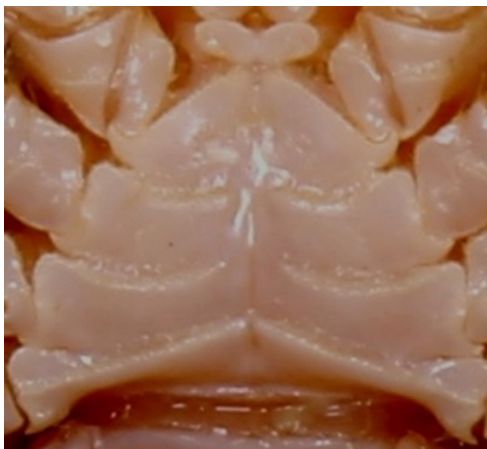
Figure 6: Munida andamanica Alcock, 1894- Sternal plastron.

The carapace, anterior part of the abdomen (segments 1-3), and appendages are reddish pink, while the posterior half of the abdomen including the tail fan is white; P1 fingers are white with reddish tips and P2-4 are white on the proximal half, reddish on the distal half; the base of the rostrum are deep red in colour. While, accidental by-catch fresh specimen is muddy and sand soil with red and catchy in colour. Alcock (1894) quite well agree with specimen are “cephalothorax and appendages pink, abdominal region white”.