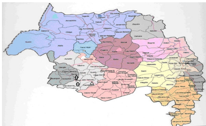
Figure 1: Map of the study districts are indicated by arrows.