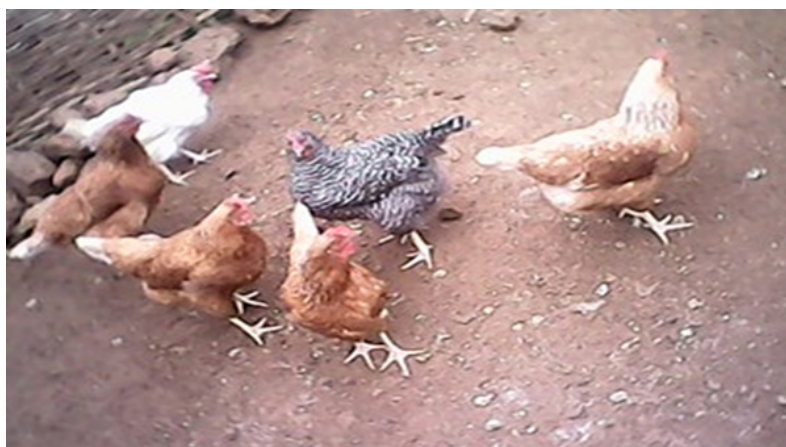
Figure 2: Bovans Brown, Bovans White (commercial layers) and Potchefstroom Koekoek (dual).