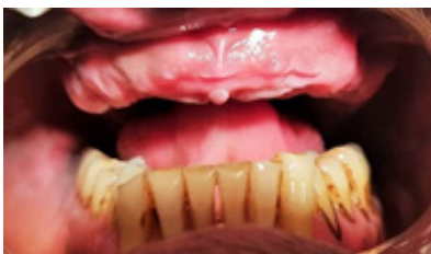
Figure 2: Preoperative intraoral.

The intraoral findings revealed completely edentulous upper arch (figure 2). No teeth were missing in lower arch. Radiographic findings showed good prognosis with lower teeth. [4]