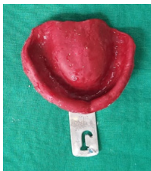
Figure 3: Primary impression Extra - oral. Photograph - maxillary. & mandibular arch.