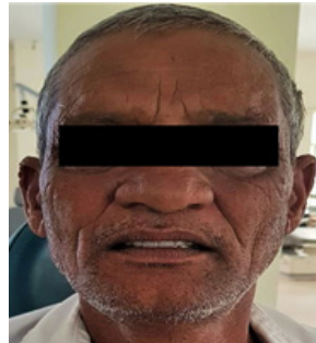
Figure 11: Postoperative.