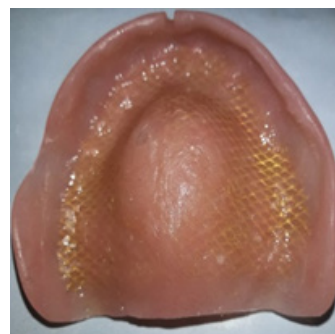
Figure 9: Impression surface.

Due to biomechanical differences in the supporting tissues for opposing arches the patient requiring single denture opposing a natural or restored dentition faces a challenging job for the dentist. Thus the treatment planning and the prosthesis to be given should be evaluated, fabricated and corrected to provide a stable prosthesis having stable functional relationships for controlling the resorption, discomfort and re-establishing esthetics, phonetics, masticatory functions and other lost functions of the patient (figure 9).