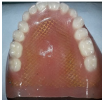
Figure 8: Polished Denture Mesh – work complete