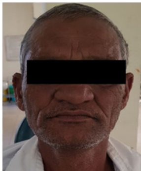
Figure 1: Pre-operative.

A 58 years old male patient was reported to Loni, Department of Prosthetic Dentistry Rural Dental College, (figure 1). His chief complaint was to replace his missing upper teeth. The main reason for missing teeth was generalized periodontitis. He had beedi smoking habit and no significant medical and systemic illness. History of using maxillary denture which had been fabricated 3 months ago and was fractured.