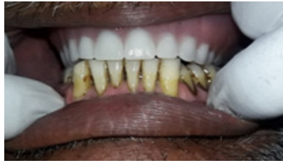
Figure 10: Prosthesis intraorally.