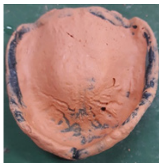
Figure 5: Final impression.