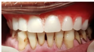
Figure 6: Try-in done.