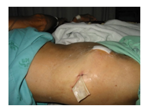
Figure 3: After operation of 5<sup>th</sup> patient.