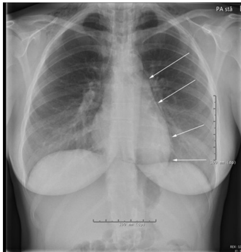
Figure 1A: Frontal x-ray. Arrows indicate pneumomediastinum left and distal to the heart and extending up in the mediastinum with bilateral subcutaneous emphysema.

Blood pressure 2 hours postpartum was 105/74 with a heart rate of 105. Electrocardiogram and blood samples were normal, while x-ray showed pneumomediastinum left and distal to the heart and extending up in the mediastinum with bilateral subcutaneous emphysema (Image A and B).