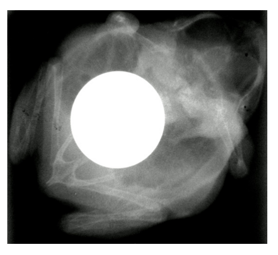
Figure 1: Tomato frog (Dyscophus guineti). Dorso-ventral (DV) radiogram revealed the presence of a round, radiopaque foreign body.