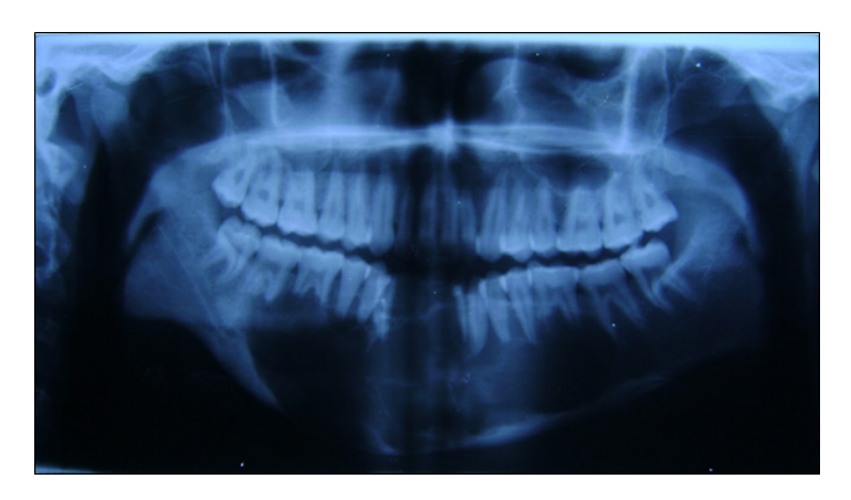
Figure 7: Orthopantomograph showing "soap bubble" appearance of lesion in the mandibular anterior region.

Orthopantomograph (Figure 7) showed a well- defined multilocular radiolucency extending from 37 to 47 antero-posteriorly and supero-inferiorly from alveolar ridge descending down expanding the lower border of mandible crossing the midline. Postero-anterior view (Figure 8) showed a multilocular radiolucency with "soap bubble" appearance in the midline of mandible.