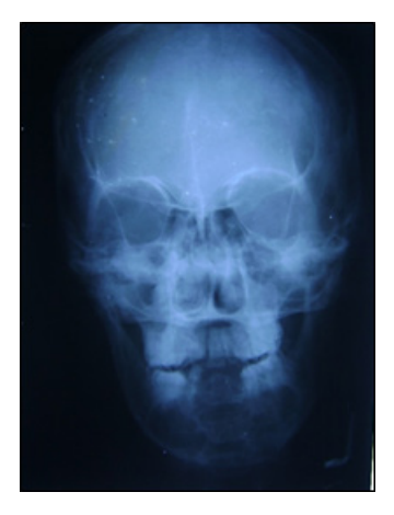
Figure 8: Postero-anterior view showing multilocular radiolucency in the mandibular anterior region.

Incisional biopsy (Figure 9) revealed fibrous connective tissue with islands of odontogenic epithelium. Epithelial islands showed peripheral tall columnar cells. Nucleus showed reverse polarity. Cytoplasm towards basement membrane showed vacuolization. Central stellate reticulum like cells undergoing squamous metaplasia in some islands giving a histopathological diagnosis of Follicular Ameloblastoma.