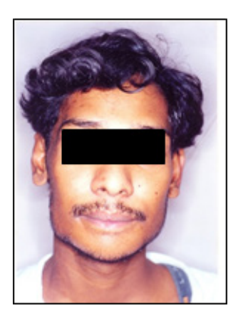
Figure 11: Extra-oral view of post-operative regression of lesion.

The patient was followed up (Figure 11,12) for 2 years and remained clinically and radiographically disease free.