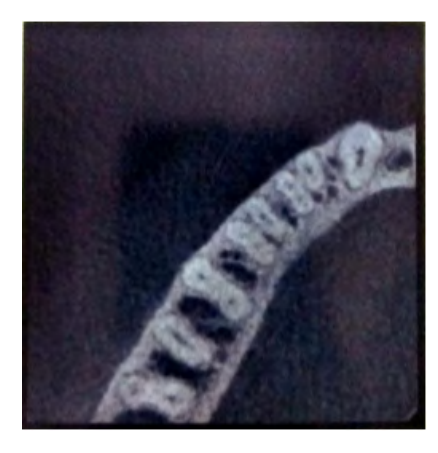
Figure 2b: CBCT scan at middle third of the roots of tooth #45.