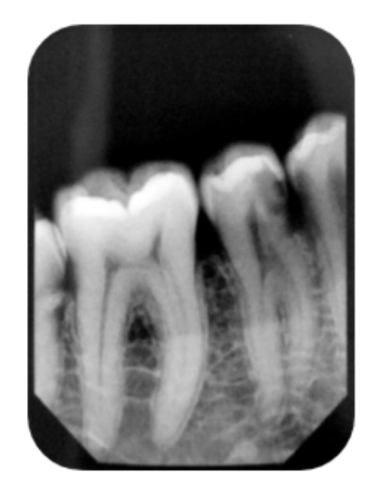
Figure 1: Pre-operative IOPA radiograph of tooth #45.

A 29-years-old healthy male patient reported with spontaneous pain in tooth #45. Clinical examination showed mesial caries in tooth #45. Electric pulp test showed an exaggerated response when compared to the adjacent and contra-lateral tooth, suggestive of symptomatic irreversible pulpitis (SIP) in tooth #45. IOPA radiograph showed caries involving the pulp and bifurcated roots with both teeth #44 and #45 (Figure 1). Due to the suspicion of complex root canal configuration; a CBCT scan was advised after obtaining the patient's informed consent. The CBCT scan revealed four root canals, two in the mesial and two in the distal root starting at the level of the middle third of the root. The mesial canals were observed to be merging further apically (Figure 2a, 2b). Patient's informed consent was taken and root canal treatment was initiated in tooth #45.