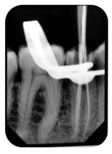
Figure 4: Master cone IOPA radiograph of tooth #45.

The canal orifices were enlarged with Protaper Gold Sx rotary file (Dentsply, Maillefer). The root canal preparation was carried out with hand K- files (MANI Inc. Japan) followed by NiTi rotary 4% taper files. The final preparation was done with 25/04 Flexicon X5 files (Flexicon, Johnson City, Tennesse, USA). The root canals were copiously irrigated with 3% sodium hypochlorite and 17% ethylenediamine-tetra-acetic acid (EDTA) solution and normal saline sequentially. After completion of root canal preparation, the canals were flooded with 3% sodium hypochlorite solution and agitated with an Endo-activator tip (Dentsply Tulsa, Dental Specialities). An IOPA radiograph of tooth#45 was taken after placing all the master-cone gutta-percha points in the prepared canals (Figure 4). The root canals were dried with 4% paper points (DiaDent, Dia-ProTTM, Korea). The canals were then coated with AH Plus sealer (Dentsply International Inc.) and the obturation was carried out with warm vertical compaction of the gutta-percha. The access cavity was restored immediately with temporary restoration (Cavit, 3M ESPE, Germany) and a post-operative radiograph was taken (Figure 5).