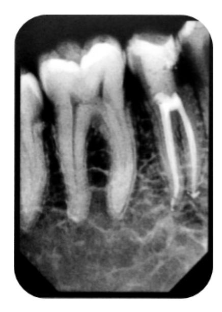
Figure 5: Post operative IOPA radiograph of tooth #45.