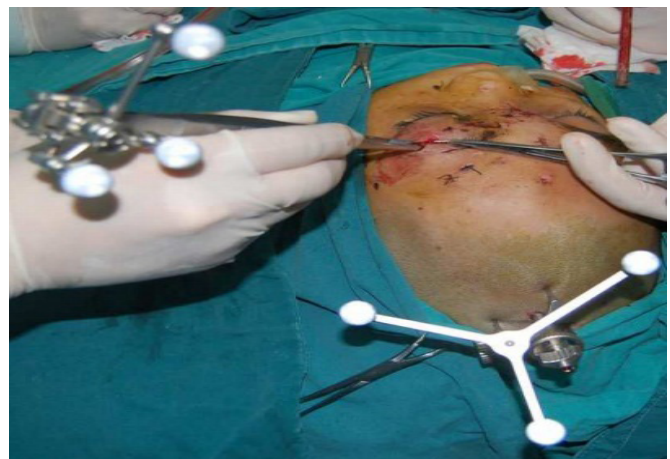
Figure 2 (d)

Figure 2: Procedure of the navigation-guided surgery. (a) The forceps clamped with a dynamic reference frame inserting into the calibration hole of the registration instrument. (b) The forceps with tracking camera for registration. (c) Real-time screen capture of the BrainLAB system indicating the navigation pointer arriving at one buckshot. (d) Removal of one buckshot directly using the calibrated forceps.