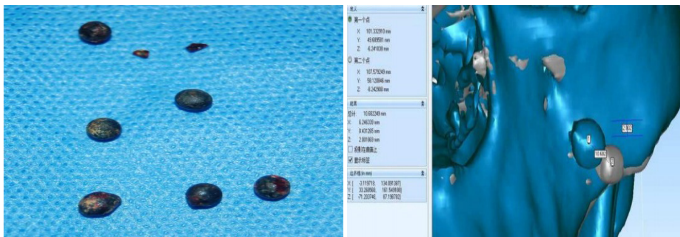
Figure 3: (a) Eight removed buckshots. (b) Image fusion of the preoperative and postoperative 3-D models.

She was discharged from the hospital 2 days later without complications. A cone-beam CT scan of the head was done and a 3-D model was established. Through image fusion of the preoperative and postoperative 3-D models, it was found that the remaining buckshot shifted by about 10 mm posterior and inferior to its original position (Figure 3a-b), probably because of the movements of the mandible and facial muscles, and because of palpation and movements from the forceps. At 1 month of follow-up, the incisions in the face were healed. The patient showed no clinical symptom. Afterwards, the girl's condition improved quickly and she recovered uneventfully.