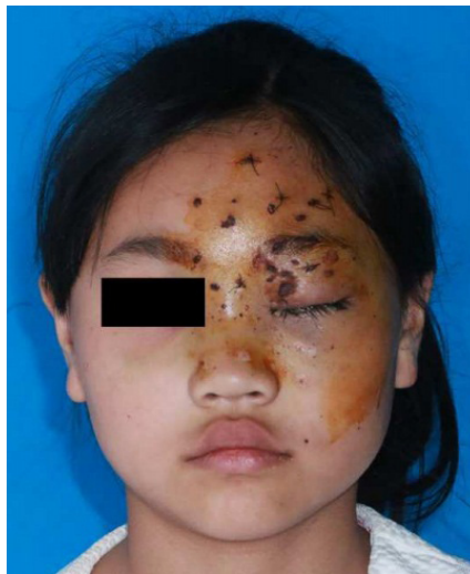
Figure 1: The patient who received a gunshot wound after emergency treatments at the local hospital and before navigation-guided surgery

While playing, a 14-year-old girl was accidentally shot in the facial area with a shotgun. She was admitted to a local hospital as soon as possible after the accident. At this local hospital, removal of the superficial shots and of the left eyeball was performed. Due to the difficulties in removing the deeper shots, the patient was transferred to the oral and maxillofacial surgery department of the West China Hospital of Stomatology (Sichuan, China) on the third day after the accident. Physical examination showed multiple buckshot wounds located on the left upper face and forehead. The left eyeball had been removed (Figure 1). A panoramic radiograph indicated multiple small spheres with high-density in the facial area. A CSN operation was prepared for removing these FBs because of the risk of chronic pain if they were left in place.