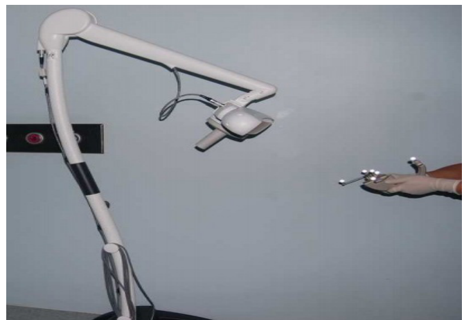
Figure 2 (b)