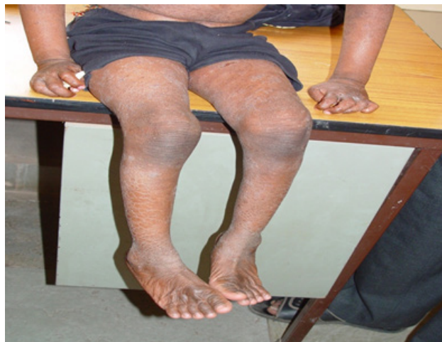
Figure 2: Spastic diplegia.