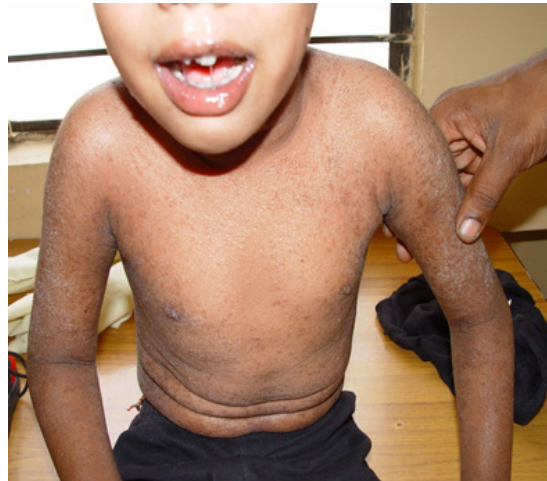
Figure 1: hyperkeratotic hyperpigmented patches on knee and dorsum of feet.

MRI finding revealed bilateral cerebral atrophy with prominent sulci and subarchnoid space (in case 1). Delayed myelination (in case 2).