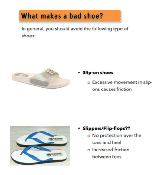
Figure 3: Sample page of patient education package.

To make the brochure easily readable, we presented all information in short sentences and used colourful pictures and diagrams to illustrate each point (refer to figure 3).